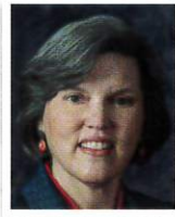
Honorable Beverly J. Doneker WORKERS' COMPENSATION OFFICE OF ADJUDICATION